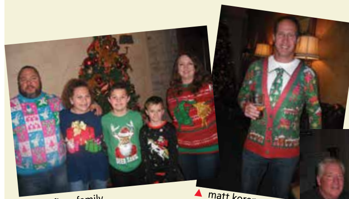
▲ the ficco family