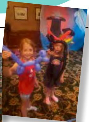
Balloon Twisting for Kids